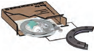
United F-06 "Fireflo" Hydrant Safety-Flange Repair Kits