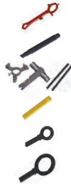
United F-06 "Fireflo" Hydrant Tools