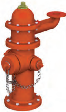
United F-06 "Fireflo" Hydrant Optional Monitor Flange (3" or 4" outlet)