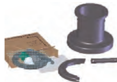
United F-06 "Fireflo" Hydrant Extension Kits