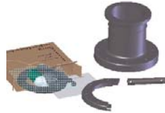
United F-06 "Fireflo" Hydrant Extension Kits